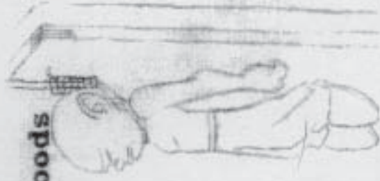
Trouble Making Neighba