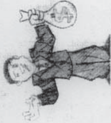
Neighba Buyin' Freedom